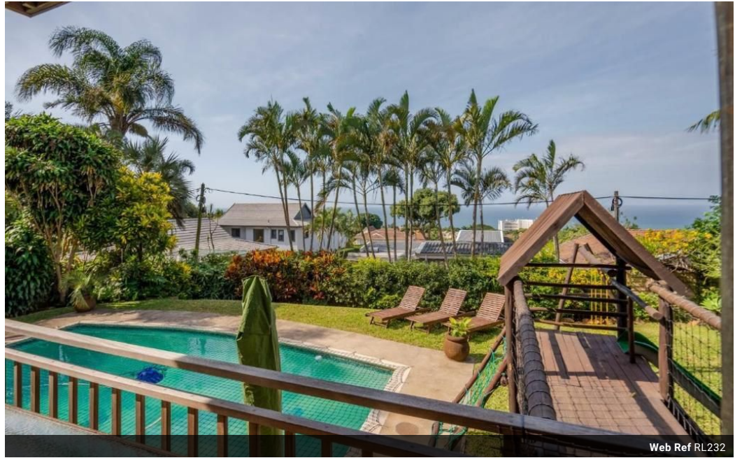
Web Ref RL232